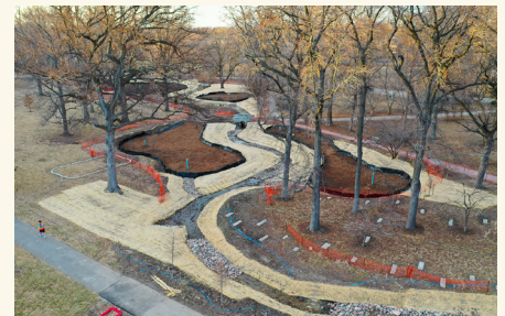
East Stream Restoration