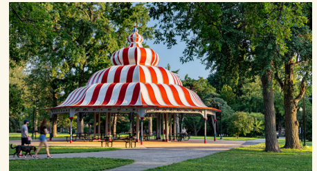
Old Playground Pavilion and Turkish Pavilion