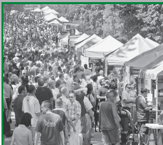
The incredible sized crowded at the Festival

The International Institute of St. Louis hosted yet another successful Festival of Nations in Tower Grove Park on August 27 and 28. It is estimated that over 100,000 people from St. Louis and surrounding areas attended this celebration of world cultures, making it quite possibly the largest event ever in the Park. The Festival of Nations offered a tremendous variety of music, crafts, and demonstrations, with over 40 different food booths from countries all over the world. It was a wonderful event, which the Park has been pleased to host and sponsor since its inception in 2000.